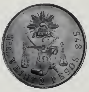
Lot No. 2431